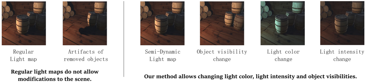
Figure 1: Our approach allows modifications to the scene during run-time such as hiding and showing objects and changing the color and intensity of any number of light sources.

Ahmet Oğuz Akyüz Middle East Technical University akyuz@ceng.metu.edu.tr